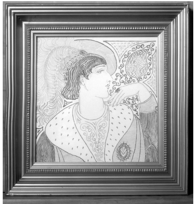
San Amant Photograph negative of painted ceramic tile