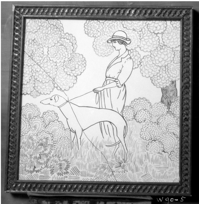
Girl with Dog Photograph negative of painted ceramic tile