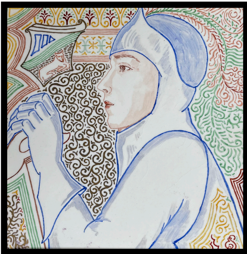
Grainger, Ella Viola Ström Knight in armor Painted ceramic tile 6“ x 6”