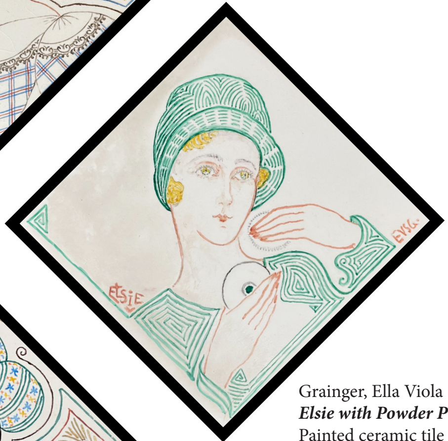
Grainger, Ella Viola Ström Elsie with Powder Puff Painted ceramic tile 6" x 6"