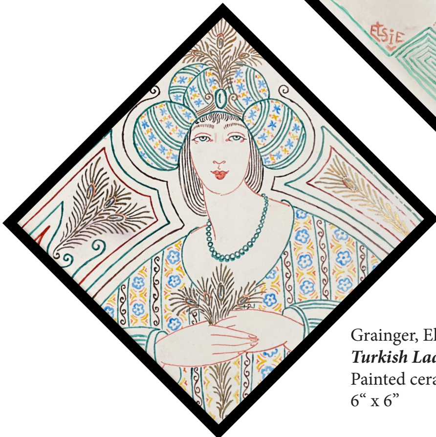
Grainger, Ella Viola Ström Turkish Lady Painted ceramic tile 6" x 6"