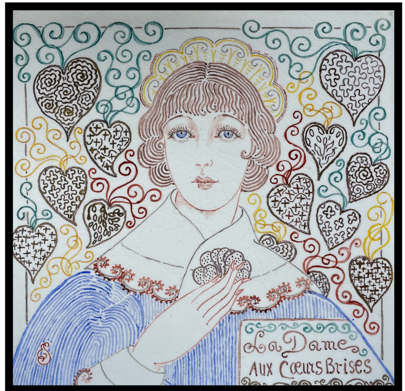
Grainger, Ella Viola Ström La Dame aux coeurs brisées Painted ceramic tile 8" x 8"

"The idea of portraits in tiles was inspired by the decorative tiles set round Swedish stoves, and the Dutch tiles, which bear attractive pictures." Portraits on Tiles , an illustrated article in The Sun (London) Sunday May 9, 1926.