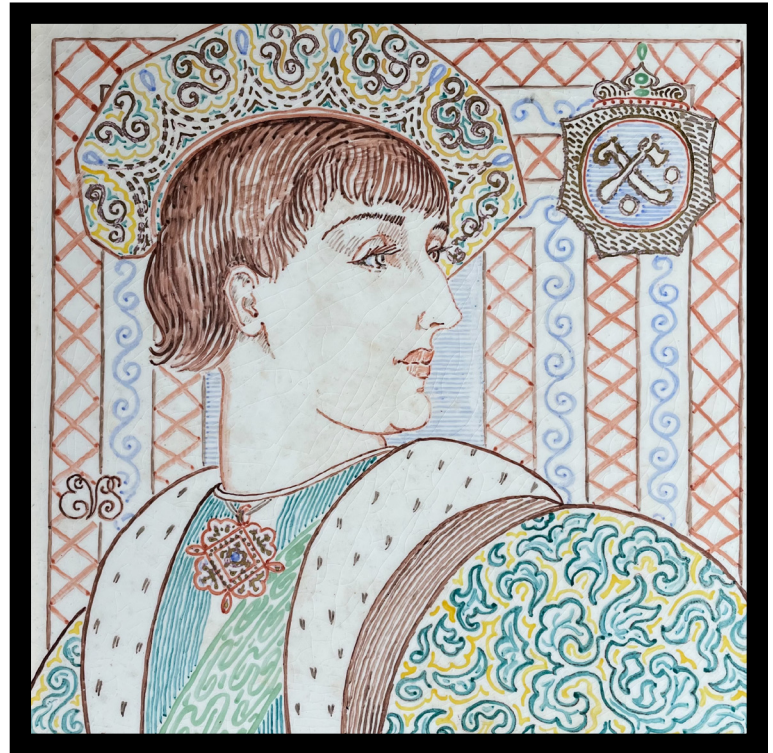
Grainger, Ella Viola Ström Masterful Knight Painted ceramic tile 8“ x 8”

The adjacent tiles are part of her “Knightly Series”.